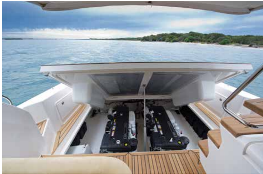
The 'floating' cockpit sole lifts to provide all-around access to engines.

It was very apparent that the owner of Riviera 43FB #51 was into his sports fishing with a pair of Relax outriggers and a centre rigger plus a Relax 130lb fighting chair fitted. At trolling speeds, the Volvo Penta IPS 600s are using less than 50 lph and give a range of close to 300nm.