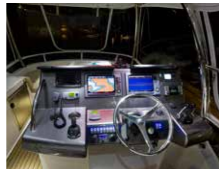
The ergonomically designed aft helm features a full array of instruments and controls.

When Riviera say in their brochure that when you buy a Riviera, you are joining a family, they really mean it. With over 5000 boats on the water, it's no surprise that they have got a loyal following. At 14.16m, the 43 Open Flybridge is the smallest boat in the seven strong flybridge line. It is also only one of two open flybridge boats offer by Riviera. However while the trend has certainly gone to enclosed hardtops in the larger models, when it comes to boatS of this size, the open hardtop is still a great option.